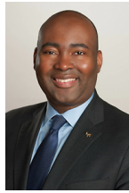
Jaime Harrison U.S. Senate Candidate, South Carolina