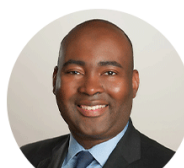
(R) LINDSEY GRAHAM