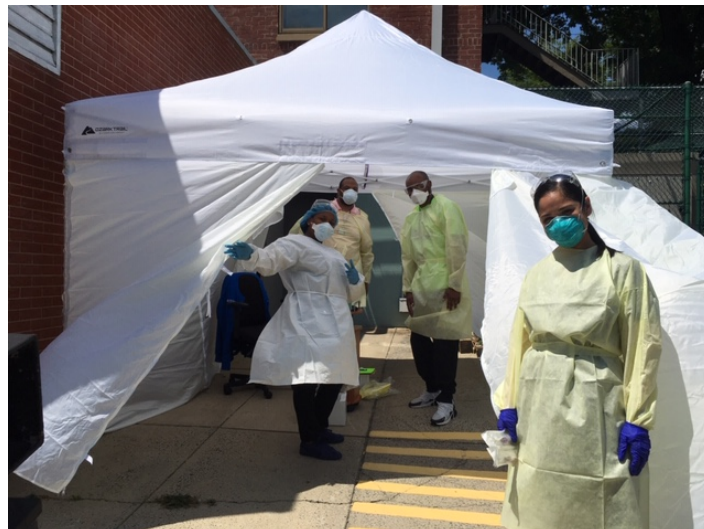
C.W. Williams Community Health Center staff are geared-up for COVID-19 testing at its Wilkinson Boulevard facility.