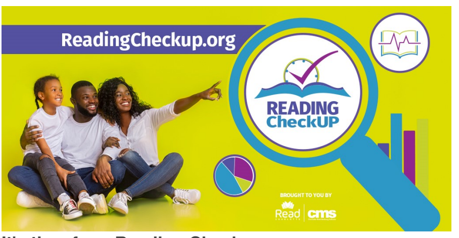
It's time for a Reading Checkup.

Find out a rising K-4 child's reading level and how you can help them improve their reading this summer at ReadingCheckup.org