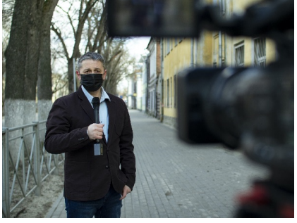
Tune into <u>Coast to Coast</u>, our new weekly conversation on building engaged

As newsrooms are hit by the economic downturn, new research shows that <u>most Americans support</u> relief for local news.