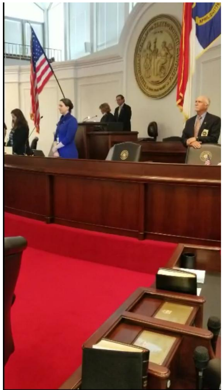
Senator Waddell leading prayer for North Carolinians affected by the virus during session.