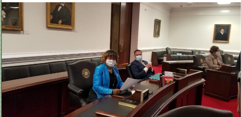
Senator Waddell and minority legislators practicing social distancing as they discuss the COVID-19 response bill, called the Pandemic.