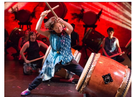
WATCH: Downtown Wichita's Gallery Alley utilizes sensory experiences to create an inclusive and accessible arts destination.