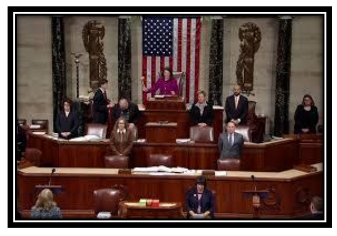
US House of Representatives

Now, while the US House of Representatives can impeach the President, it is the Senate which is to hold the trial. Impeachment of the President is important, particularly in this case, because it would be detrimental to the USA political structure for President Trump to continue to be eligible for public office—as an