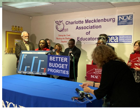
Senator Waddell speaks at a press conference in Mecklenburg County advocating for increasing teachers pay & cost of living adjustment for retirees.