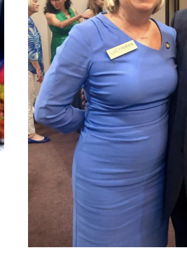
With Judge Lucy Inman