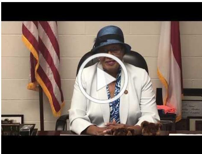
Congresswoman Alma S. Adams, Ph.D.

I hope to see you and your family there!