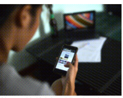
Along with Knight, philanthropic orgs across the country are making commitments to shift assets to more diverse asset managers.