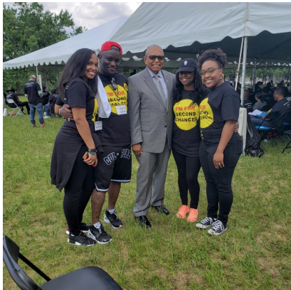
Several advocates from Durham and Charlotte attending the rally on Halifax Mall

Click here to view a side-by-side comparison of Governor Cooper's budget (H588) and the House budget (H966)