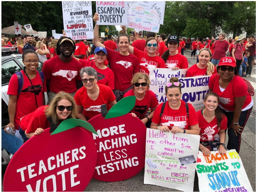
2018 Teacher Rally in Raleigh. I'll be back in Raleigh standing with teachers on May 1, 2019.