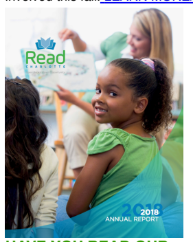
HAVE YOU READ OUR LATEST ANNUAL REPORT?

High-quality tutoring is a vital piece of the puzzle when it comes to improving early literacy in this community. We have been honored to work with hundreds of selfless and dedicated volunteers this school year. YOU can make a difference, too. Join the movement and consider getting involved this fall. LEARN MORE>>>>