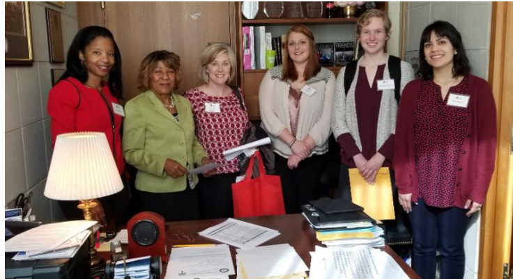
Senator Joyce Waddell discusses mental health initiatives with representatives from the NC Chapter of the American Foundation for Suicide Prevention (AFSP)