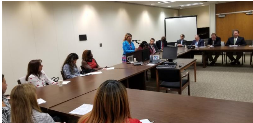
Senator Joyce Waddell speaks to the Charlotte Regional Realtors Association during the legislative visit today

Charlotte Mecklenburg Arts & Science Council meets with Senator Waddell to discuss NC