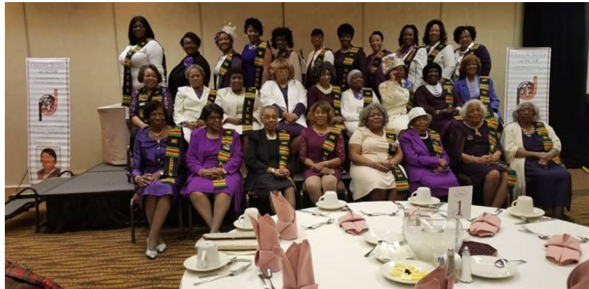
NCNW 25th Annual Brotherhood/Sisterhood Celebration