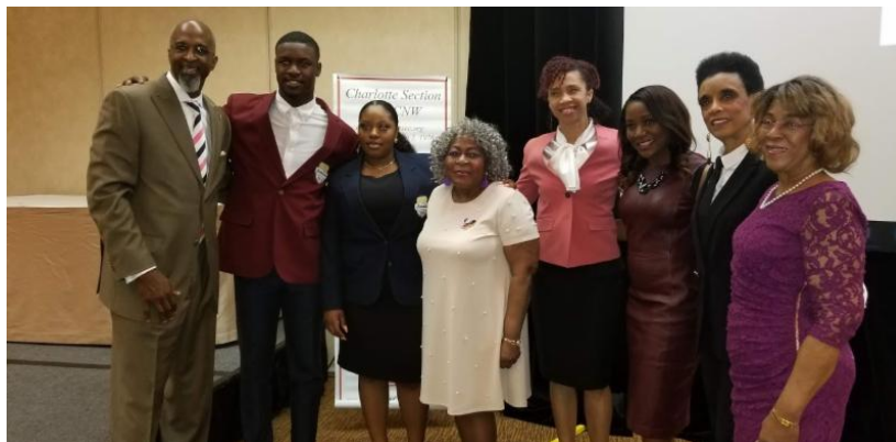
Senator Waddell shared with members of the National Council of Negro Women about legislation related to women's issues