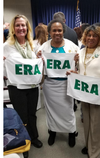
Members of the House and Senate wore white and green to stand in support of filing the Equal Rights Amendment.