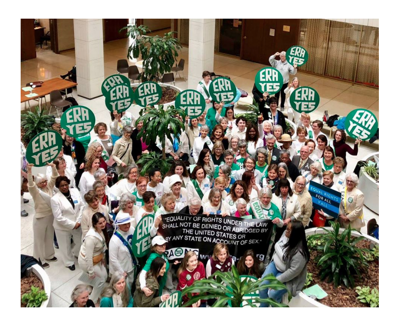
House Democrats Introduce Bill to Ratify Equal Rights for Women

The U.S. Constitution does not guarantee equal rights for women. The Equal Rights Amendment (ERA) would change that. It would guarantee that "[e]quality of rights under the law shall not be denied or abridged by the United States or any State on account of sex."