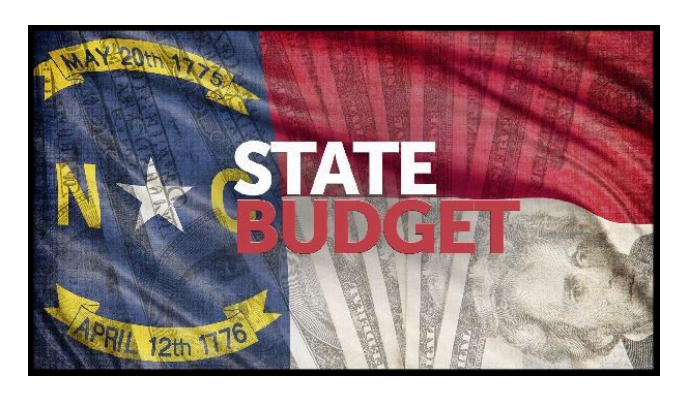
Gov. Cooper Proposes State Budget, Education Bond, and Medicaid Expansion

Typically, the most important piece of legislation in the session is the State Budget. The State Budget bill raises and spends billions of dollars and often includes many important changes in law or policy.