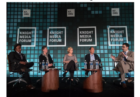
Announcing the inaugural <u>Knight Public</u> <u>Spaces Fellowship</u>: Nominate a leading civic innovator (including yourself) by March 22.

Conversations to strengthen local news, media and democracy: Watch the Knight Media Forum live starting now.