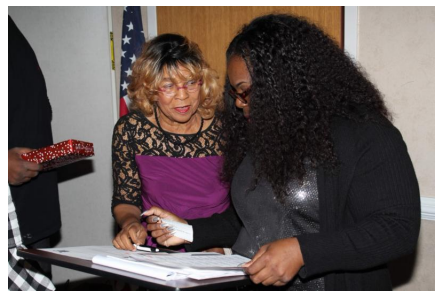
{\bf Annual\ Mecklenburg\ First\ In\ Families\ Holiday\ Luncheon\ Saturday,\ December\ 15th.}