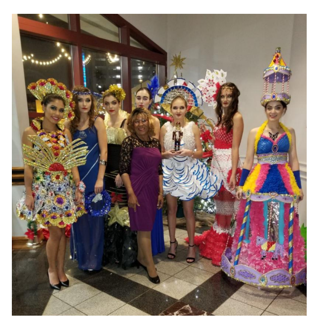
I enjoyed attending the 2nd Annual Holiday Angels Fashion Show, Toy Drive and Pageant Saturday, December 15th. Over 45 youth and young adult models showcased the latest holiday and winter fashions.