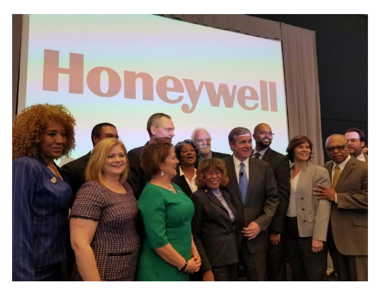
Press Conference announcing Fortune 11.30.18