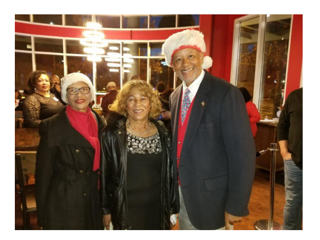
Had the pleasure of Supporting the Black Political Caucus of Charlotte-Mecklenburg Sunday, December 16th as they hosted their annual Chairman's Open House and Membership Drive.