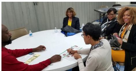
Enjoyed the afternoon meeting with my wonderful constituents at Reeder Memorial Church 10.18.18