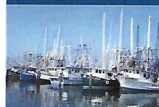
The Beautiful Gulf Coast Awaits

Diamond Tours inc. Bringing Group Travel to a Higher Standard®