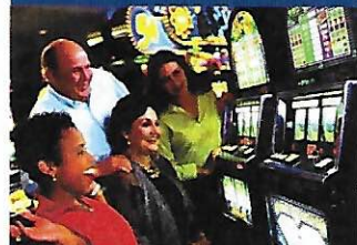
Give Lady Luck a Spin!