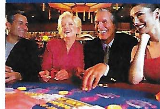
First Class Gaming