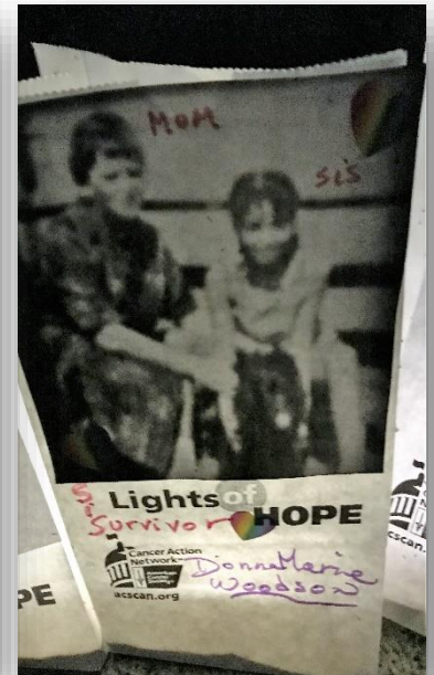
Mom and Me

The truth is we're all only "1 Degree Way" from a cancer diagnosis. If you're interested in becoming a member of the American Cancer Society Cancer Action Network, please let me know. I'd be happy to welcome you to our family whose mission and dedication is to finally find a cure.