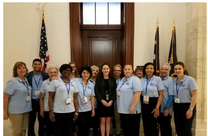
North Carolina Member Advocates

I'm honored to be a voice for the voiceless and use my advocacy power to affect legislative change. As Advocate Ambassadors we educate our Representatives and serve as their liaison for Healthcare and Cancer issues. An exciting surprise for me at this years' Summit was being the recipient of the 2018 Ambassador Leadership Award.