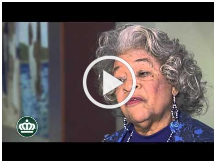
Sunset Beatties Ford Road Area CNIP

For more information about this project, please visit the CNIP website . And for more information about other projects included in the neighborhood improvement bond, please visit Vote Yes for Bonds website .