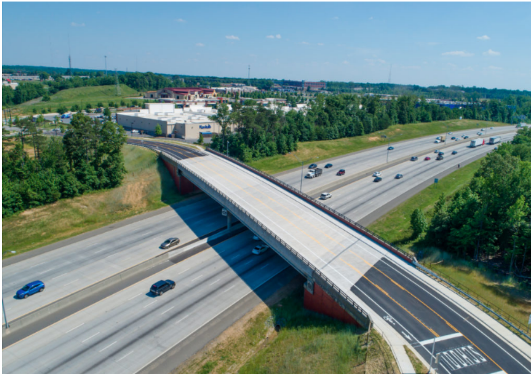
University Pointe Bridge (I-85 south bridge) was made possible by bonds funding approved in 2014 and 2016.