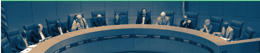
An update to the Mecklenburg Board of County Commissioners from the County Manager