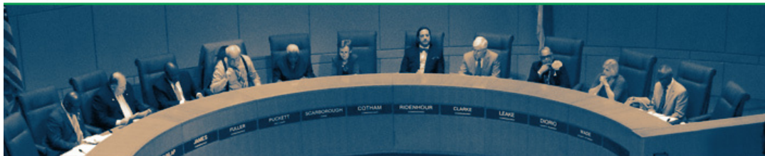
An update to the Mecklenburg Board of County Commissioners from the County Manager