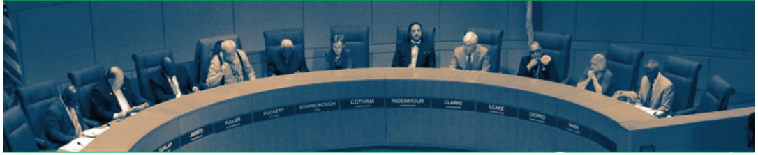
An update to the Mecklenburg Board of County Commissioners from the County Manager