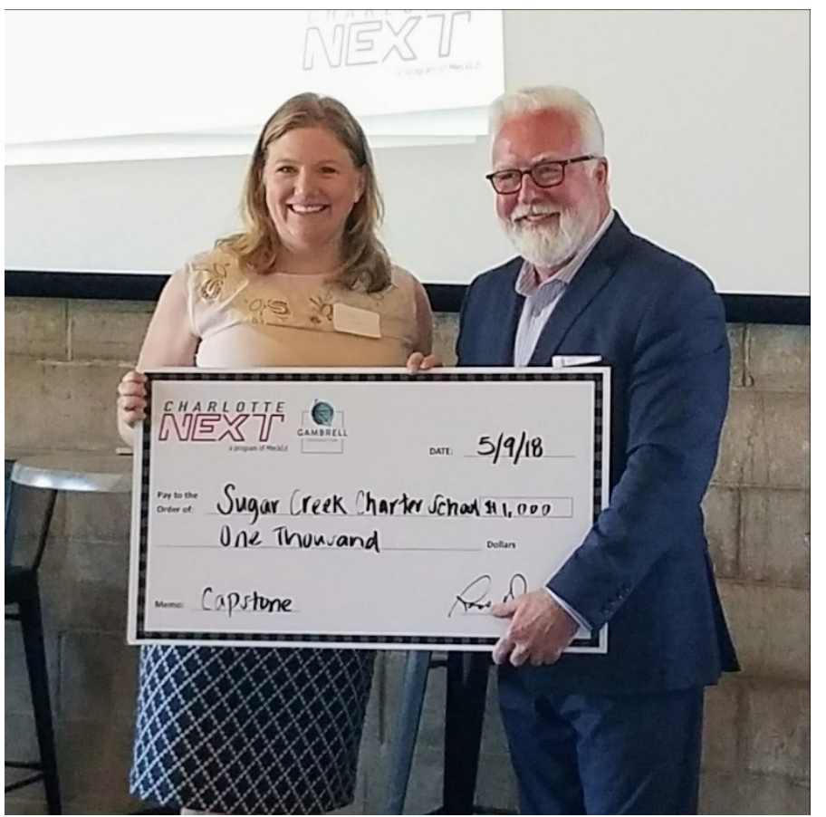
Congratulations to our 14 OST providers who presented during our Capstone Day!

Behailu Academy Firm Foundations Freedom School Partners Girl Asypre Girl Scouts, Hornets' Nest Council Girls on the Run Charlotte Greater Enrichment Program McClintock Partners in Education New Outreach Christian Center Spiritual Inheritance Ministries Sugar Creek Charter School Trips for Kids Charlotte Winners PLUS Inc.