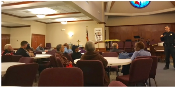
North Division CMPD Neighborhood Advisory Council