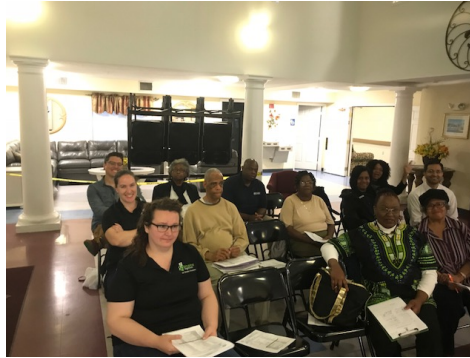
Lincoln Heights Community Meeting (April 26)

AFFORDABLE HOUSING – On April 23, the City Council approved more the remaining $6.8 million in our Housing Trust Fund (from 2016 bond approval). 11 Projects asked for a combined $24 million. Of the 11, three of them are in a "non-competitive" state tax credit applicant pool. Monies for these three were approved. I, along with two other council members though $5 million of that money could have been better spent on helping lower income families in the 30% Average Median Income (AMI) range, but my motion to reject $5 million ask from one project failed. I was happy the conversation about low income housing was aired in public though. The other 8 project will compete in a "competitive" state tax credit applicant pool and Charlotte will be awarded only 3. I supported funding for all 8. I am happy to be serving on the Housing and Neighborhood Development Committee. We had our first Housing Retreat on April 21 and we will introduce changes to our Housing Locational Policy and our Strategic Housing Plan soon. I called for more focus and a mandate on inclusion of at least 30% housing for families making 30% or less of AMI. Read more from the Charlotte Observer here .