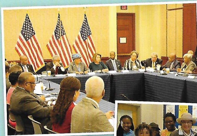
Congresswoman Adams hosts a roundtable with Democratic Leader Nancy Pelosi, Congressman Bobby Scott, and discusses policy priorities with presidents and chancellors of Historically Black Colleges and Universities (HBCU) at the U.S. Capitol during National HBCU Week.