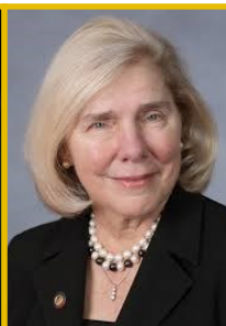
Becky Carney NC House of Representatives District 102