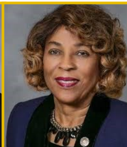
Joyce Waddell NC State Senator District 40