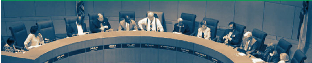
An update to the Mecklenburg Board of County Commissioners from the County Manager