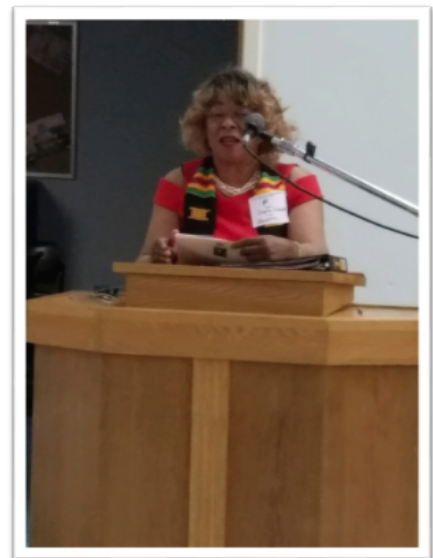
Senator Joyce Waddell brings greetings and a legislative update concerning legislation affecting women at the National Council of Negro Women's State Conference.