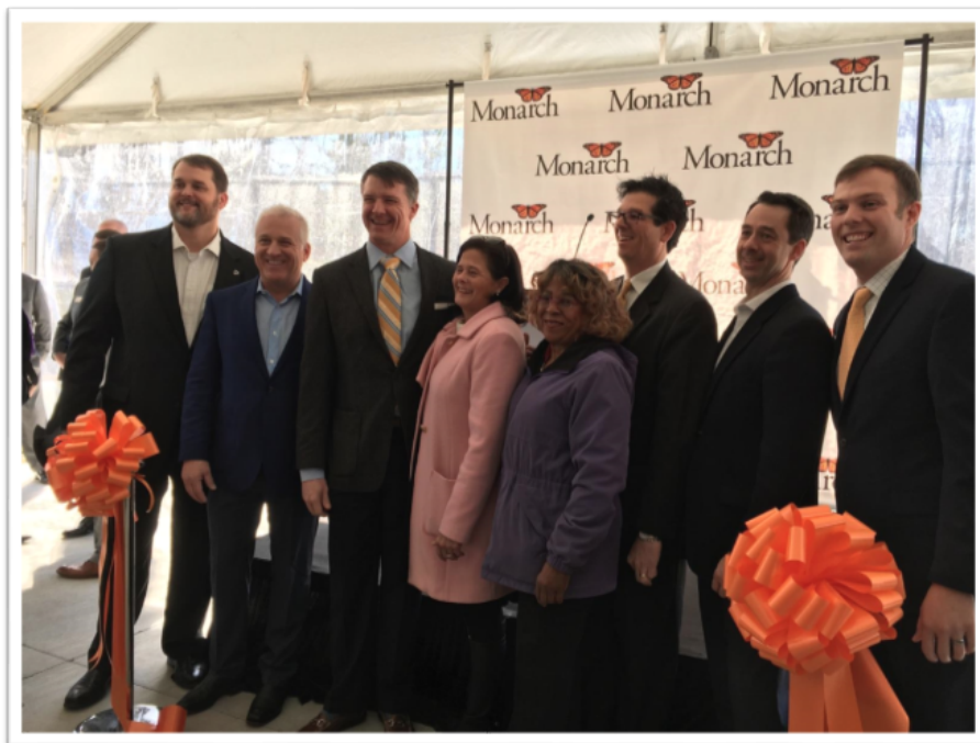
Senator Joyce Waddell participates in the ribbon-cutting ceremony of the SECU Youth Crisis Center, a Monarch program, to commemorate the opening of the first facility of its kind in North Carolina. Monarch is a nonprofit organization that supports thousands of people in North Carolina with intellectual and developmental disabilities, mental illness, and substance use disorders.