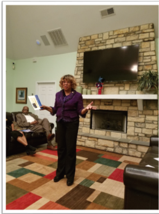
Senator Joyce Waddell discusses recent legislation at the Stone Crossing Precinct Meeting.