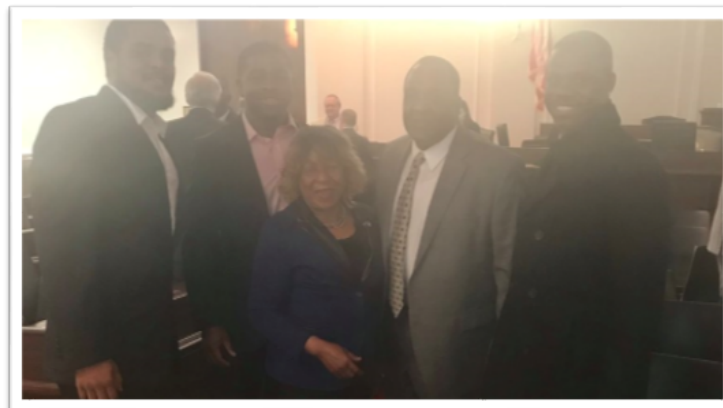
The North Carolina General Assembly recognizes the N. C. A&T Football Team for winning the HBCU National Championship for the second time in three years!