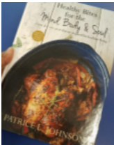
Click to view pictures:

CLICK TO PURCHASE: Amazon Barnes and Noble