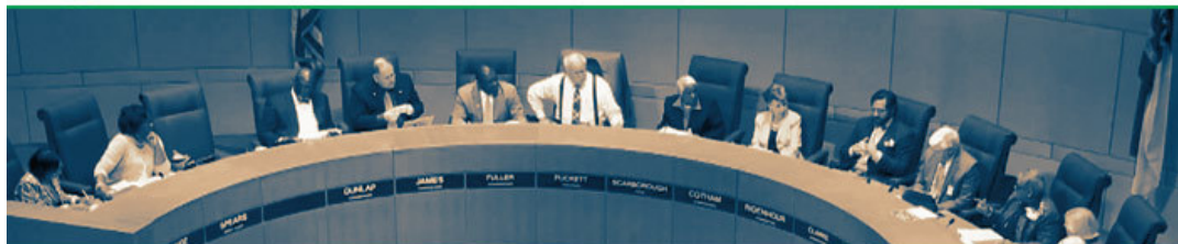
An update to the Mecklenburg Board of County Commissioners from the County Manager