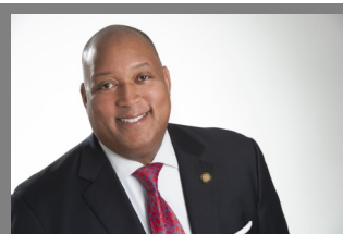
NC State Senate