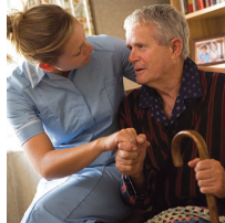
Paid Sick Days

proceeds, stocks, bonds, and contents of safe deposit boxes that typically have been abandoned for one to five years. Funds become unclaimed because the company loses track of the consumer, due to an incorrect address or other missing information. By law, these funds are escheated, or turned over, to the Department of State Treasurer for safekeeping until claimed.