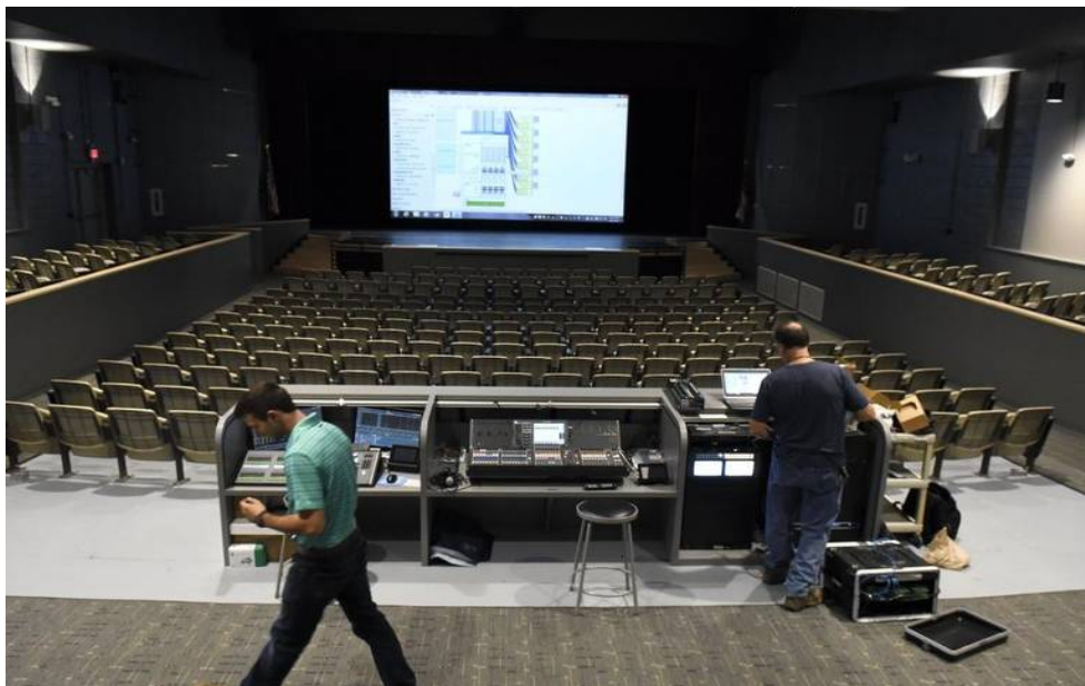
Northwest's new theater, made possible by 2013 school bonds.