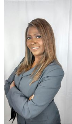
Mayor of Charlotte