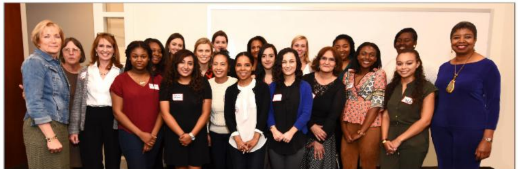
Class of 2017