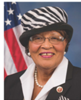
Anthony Foxx , 17th United States Secretary of Transportation