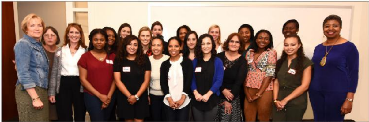
Class of 2017