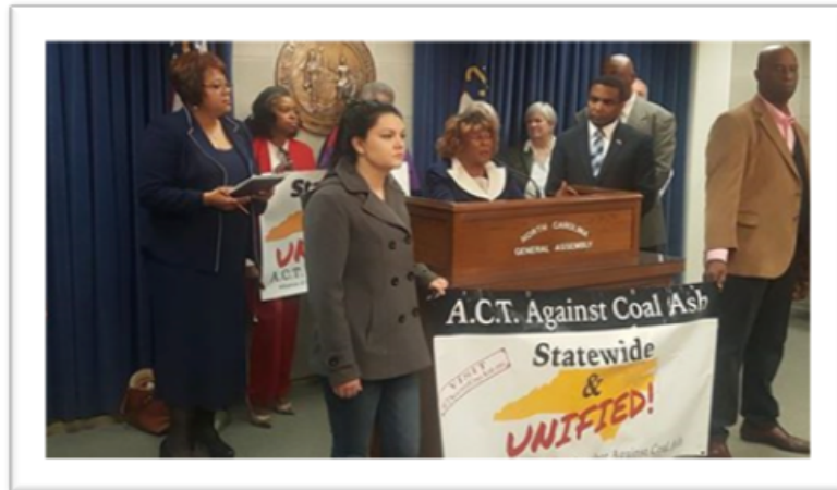
Senator Joyce Waddell and her Democratic colleagues speak at a press conference in support of the citizens affected by the coal ash. Wednesday, February 1, 2017