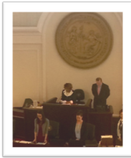
Senator Joyce Waddell leads the Senate Chamber in prayer at Session. Wednesday, February 1, 2017