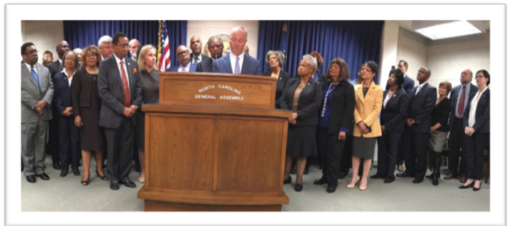
Senator Joyce Waddell joins the House and Senate Democrats in a press conference to discuss their legislative priorities for the 2017-18 session on Wednesday, January 25, 2017.

Click Here to View the NC Democrats' Top Priorities for the 2017-2018 Legislative Session