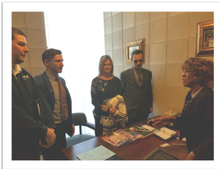
Senator Joyce Waddell meets with the Father's Rights Movement of North Carolina to discuss shared parenting legislation on Wednesday, January 25, 2017.