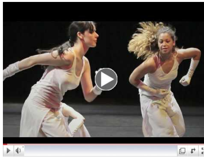
Chapman Cultural Center