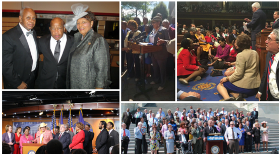
Top Left: Congresswoman Adams was honored to receive the Trailblazer award at the Annual International Civil Rights Center & Museum gala alongside her dear colleague, Congressman John Lewis and Greensboro Four member, Joseph Alfred McNeil.