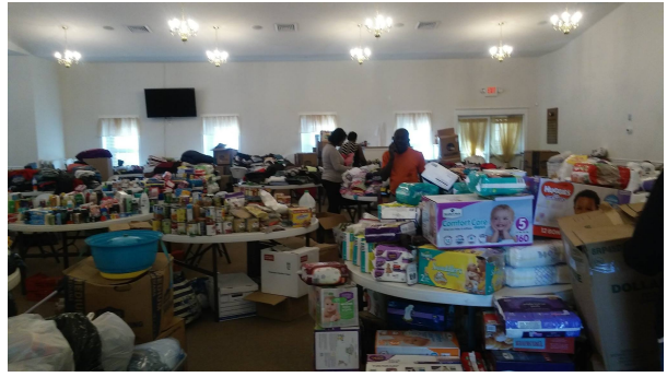
New Hope United Methodist Church, Rowland NC