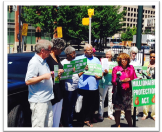
Senator Joyce Waddell speaks out against the Income Tax Cap constitutional amendment at a press conference on Monday, June 20, 2016.