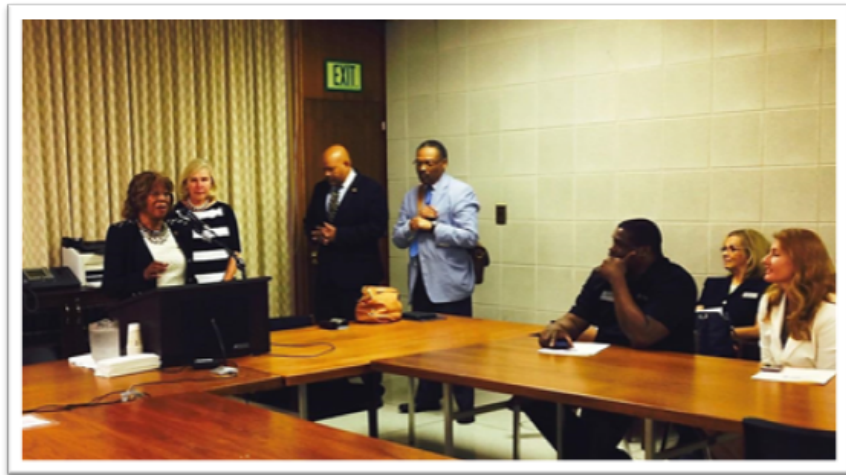
Senator Joyce Waddell, along with other members of the Mecklenburg Delegation, discusses legislative priorities of the real estate industry with Realtors® from Mecklenburg County and across the state on Wednesday, June 22, 2016.