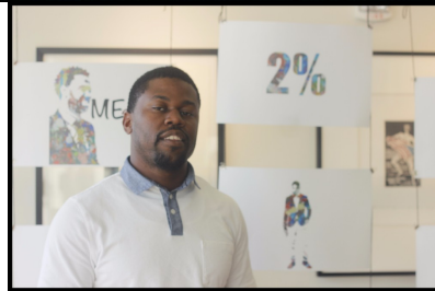
I AM A MALE EDUCATOR OF COLOR

Profound Gentlemen shares the impact that male educators of color have on the lives of boys of color.