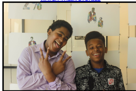
THANK YOU FOR DONATING

Thank you for supporting ME2. During the month of May, we received amazing financial support to fuel our work during the 2016-2017 school year. Thank you to over 30 supporters who financially contributed and a special thank you to the following PG Gentlemen for your contributions: