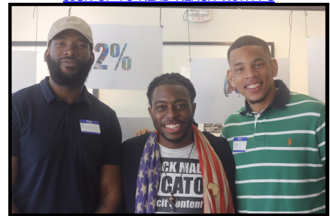
WE ARE #TEACHSTRONG

TeachStrong is a coalition of over 40 education equity organizations that have adopted nine principles we believe must be put in practice in order to modernize and elevate the teaching profession.