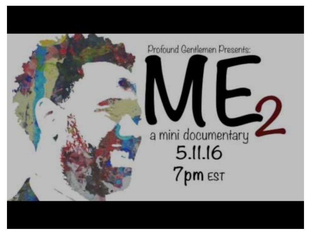
Me 2, a mini documentary that shares the impact of a Black male educator.