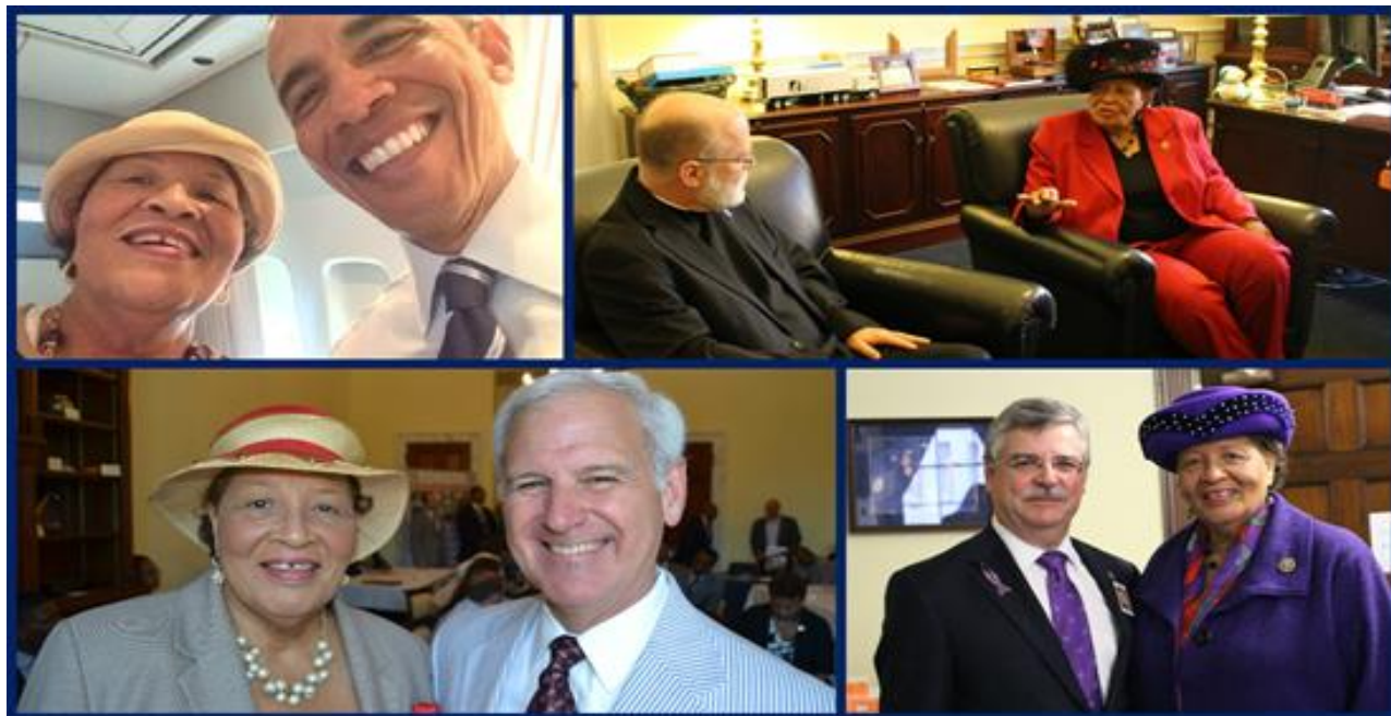
Top Left: Congresswoman Adams and President Obama take a selfie aboard Air Force One on the way to an economic summit in Charlotte.