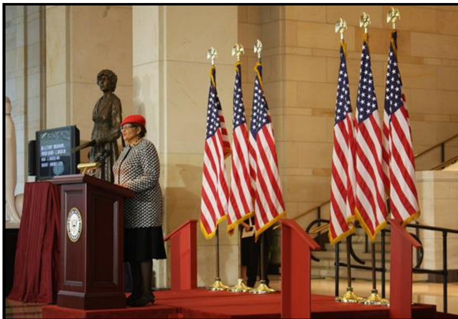
Congresswoman Adams participates in the 150th Anniversary of the ratification of the 13th amendment - which formally ended slavery. The ceremony was held in the United States Capitol Visitors center.